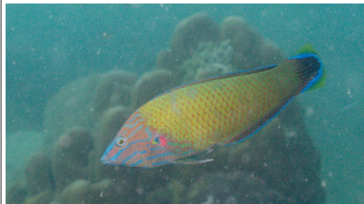
Yellow-brown wrasse, Thalassoma lutescens