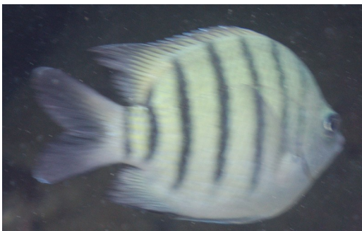
Banded sergeant, Abudefduf septemfasciatus