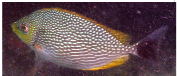
Java rabbitfish, Siganus javus