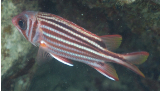
Threespot squirrelfish, Sargocentron cornutum