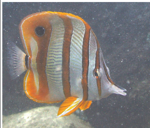
Copperband butterflyfish, Chelmon rostratus