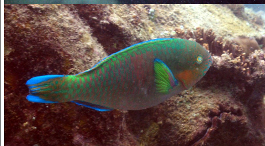
Candelamoia parrotfish, Hipposcarus harid