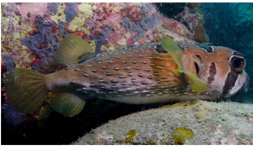
Black blotched porcupinefish, Diodon liturosus